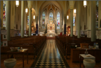
Our Lady of the Holy Cross