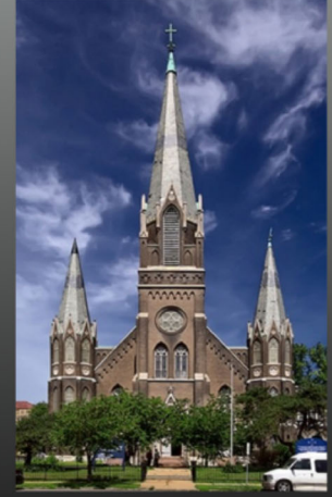
St. Matthew, the Apostle